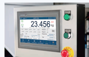
10-inch touch screen